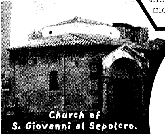
Church of S. Giovanni al Sepolcro.

Brindisi was founded by the legendary hero Diomedes. The Latin name Brundisium , through the Greek Brentesion , is a corruption of the Messapian Brention meaning "deer's head".